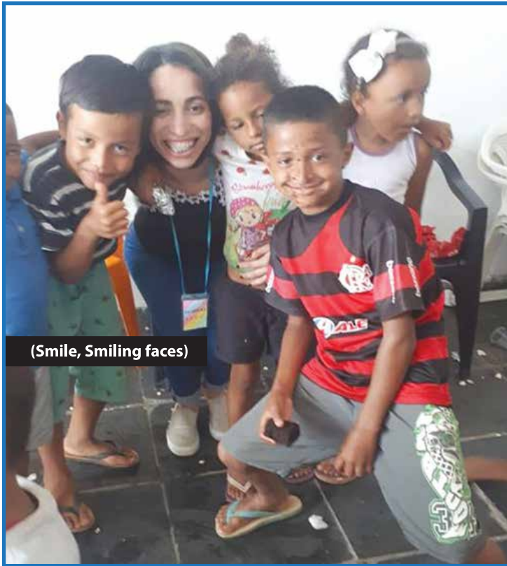
(Smile, Smiling faces)

To end the year we gave an amazing Christmas street church party. The party was in the Mosoro neighborhood of Cipo. A neighborhood that has no electricity; so no street lights for our night party. The Cipo church sponsored the event and brought a generator for lights and Santa for the more than expected 700 people.