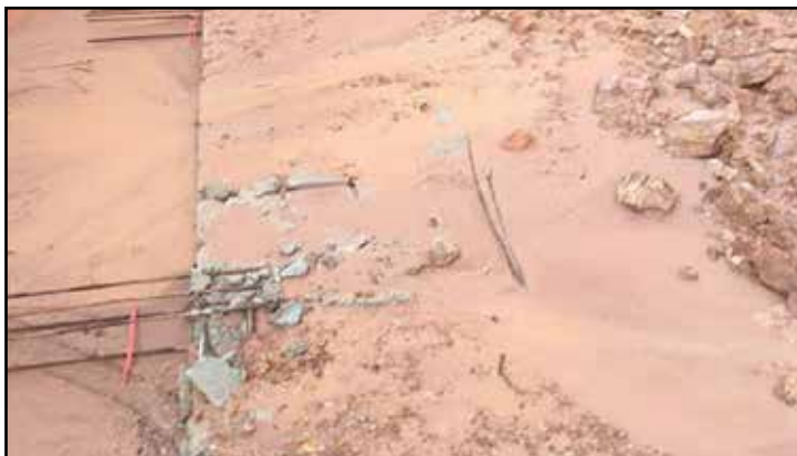
(Snapped rebar and concrete)

They have not been able to do anything but watch as the hillside deteriorates more. (Hillside coming down)