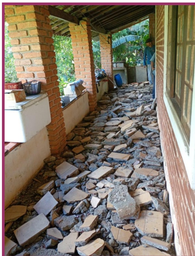
Out with the old