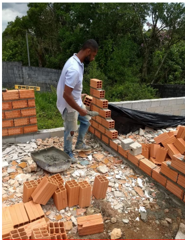
Starting a new house

We are completing 1 house a month. Some from the ground, and some we finish what they cannot complete and just make them habitable. Most that are unfinished do not have a working bathroom or a roof to stop the rain. All of them are now a visible testimony of God's love and how mysterious are His plans for us. This blessing of being chosen by Him and putting all the pieces together so they have a life changing event...WOW!