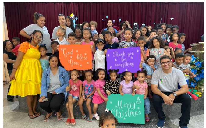
Thanks for everything!