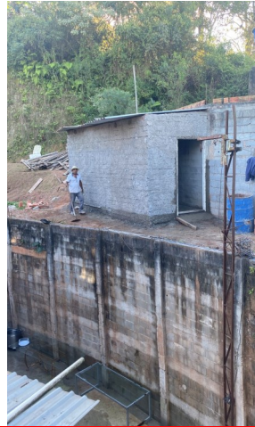
Finishing his house