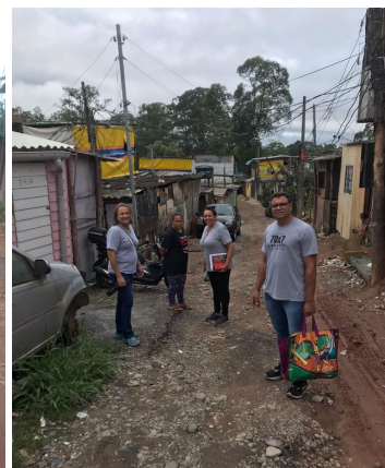
Horizonte Azul neighborhood