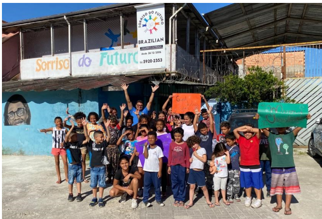
Sorriso School thanks you

We are so thankful for all who help, work, support and pray with us. The families and children are forever changed and blessed by your faithfulness. We pray for a wonderful Christmas season with Jesus as our focus. We look forward to the coming year and what God has for us.