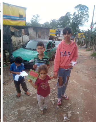
Kids in Noronha neighborhood