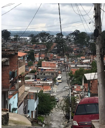
Vera Cruz neighborhood

I just want this newsletter to show how God is working in all our works. Sao Paulo is the biggest city in South America and the 4th in the world, spread out over 587 square miles and a population of over 22 million.