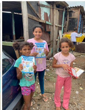
Sharing God's Word