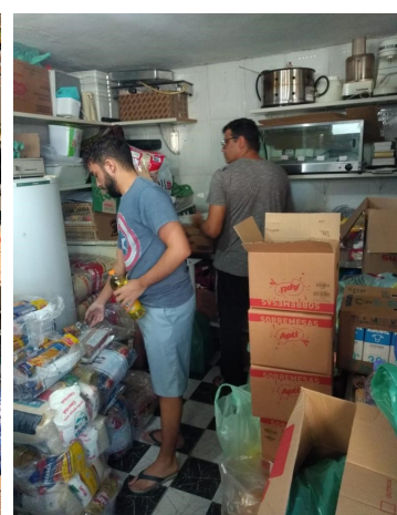
Preparing food for distribution