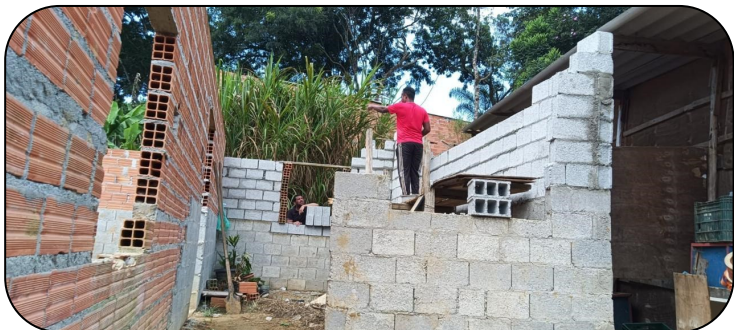
Walls going up