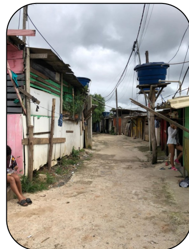
Wood and particle board houses