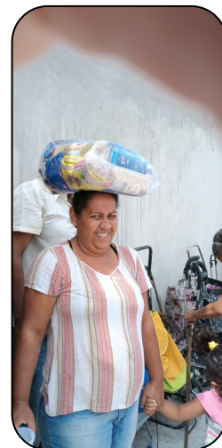
One strong lady