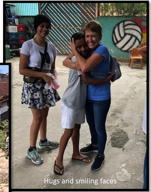
Hugs and smiling faces