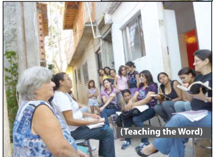
(Teaching the Word)

We even had a beautiful model to show off her new coat.