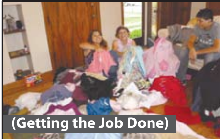
(Getting the Job Done)

This is what my house looks like when we are preparing to go to Brazil; even the dogs helped. With the help of won