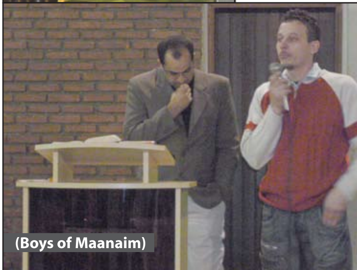
(Boys of Maanaim)

2 of the original boys that were brought to Maanaim spoke and said how they feel that they were saved and became the positive men they are because of this work.