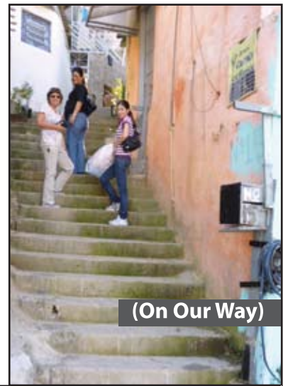
(On Our Way)

We arrived on Saturday morning and by 3PM were out in the Favelas delivering the goods. We went to 2 different locations, Pantanal and Satelite, these are locations that the church, Novidade, has worked in and have regular evangelization. At Pantanal we had a service and then did the distribution.