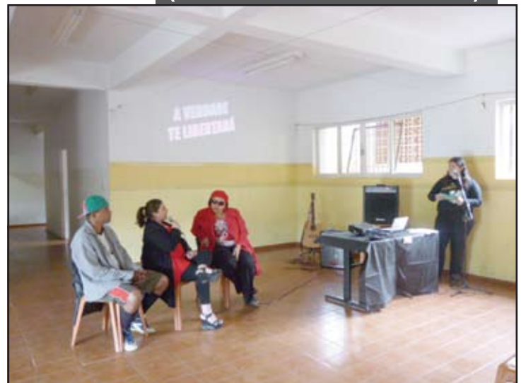
(The Truth Will Set You Free)

The show was called: A Liberdade Te Libertara , The truth will set you free. They spoke of dating, how to treat others, hard topics like abortion and drugs. It was very well presented, well accepted and you could see the impact on the kids faces. Our food distribution program is growing with more attending the services and more returning every event