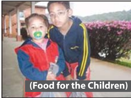
(Food for the Children)

We require that they attend and register at our evangelization events. Only returning and participating families receive the food. We know that the need is great, but we have to have accountability for the work and we not only want to feed the body but the souls. We also